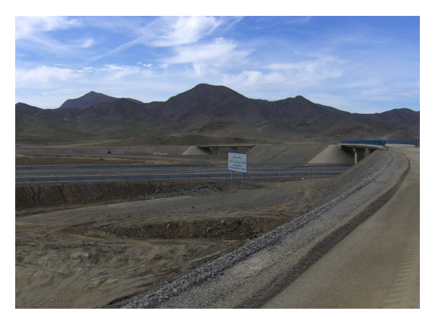
IDB approved $106.3 million for the construction of Marrakach-Agadir Highway, Morocco.