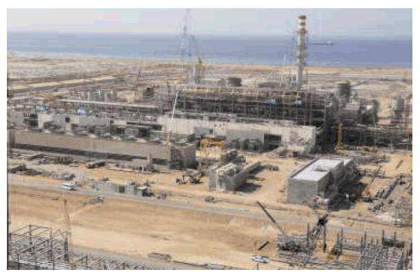
IDB approved financing of $125 million to upgrade the existing Rabigh Refinery in Saudi Arabia.

The IDB-STATCAP Initiative offers support for strengthening statistical capacity of member countries and helping them to break the vicious cycle of under-performance and under-funding of national statistical agencies. The guidelines and procedures for applying for grants under IDB-STATCAP are available on IDB website at http://www.isdb.org